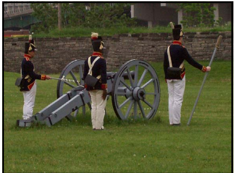
Fort York