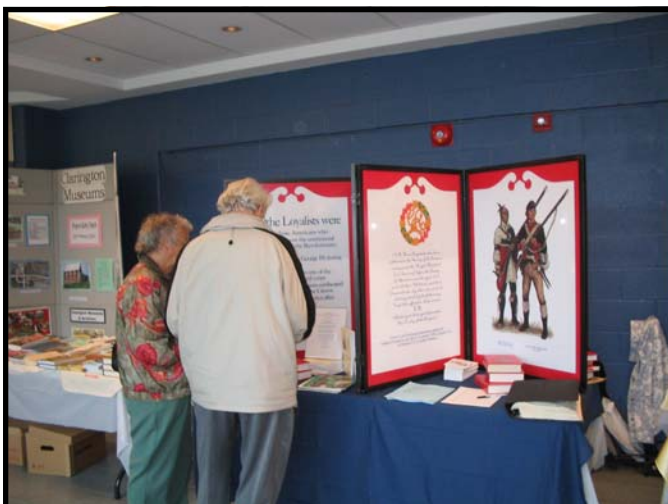
At left: Another view of the Toronto branch display.